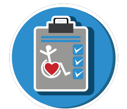
Inclusivity Assessment Tool

With the user-friendly Inclusivity Assessment Tool, you can assess physical accessibility and programmatic and administrative inclusion at recreation facilities and programs.